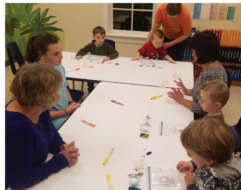
Winter Bible Blitz