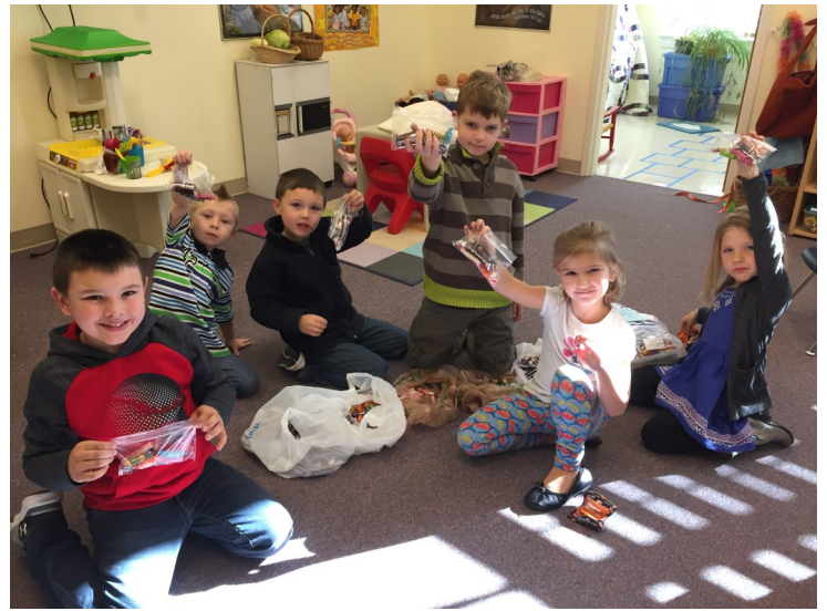
The children's Sunday school class packed 77 bags of candy for patients receiving treatment at the Massey Cancer Center.