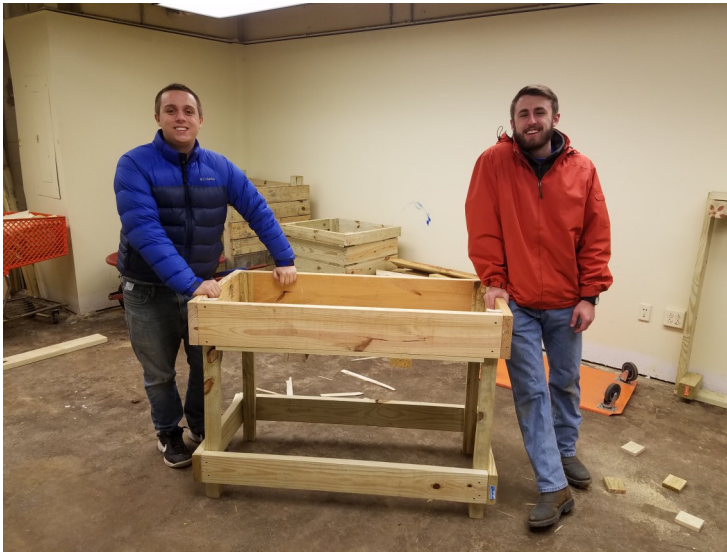
Volunteering at the Richmond Community ToolBank over Winter Break