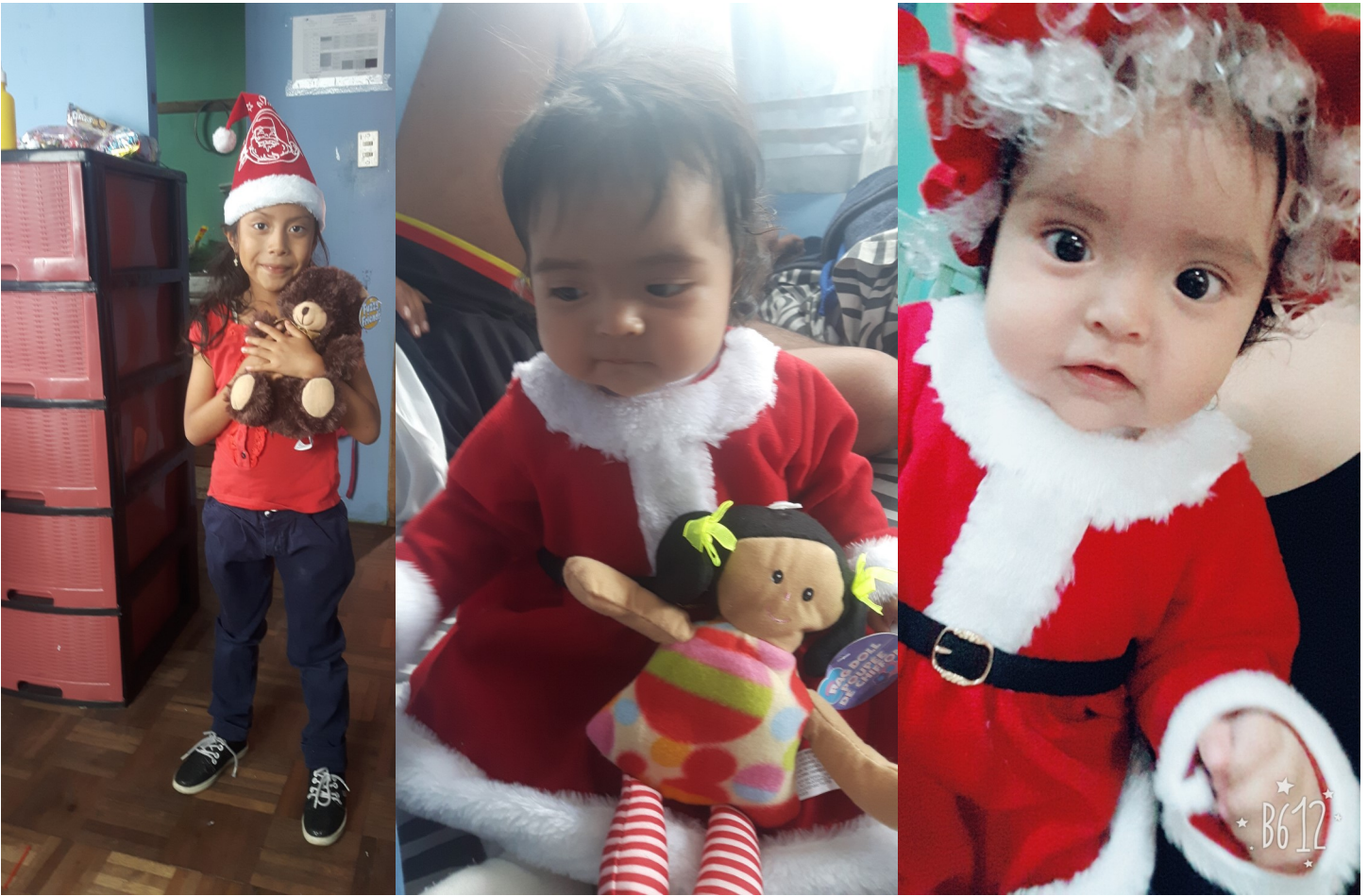
A family in Quito, Ecuador, who received an Operation Christmas Child Shoebox from GBC