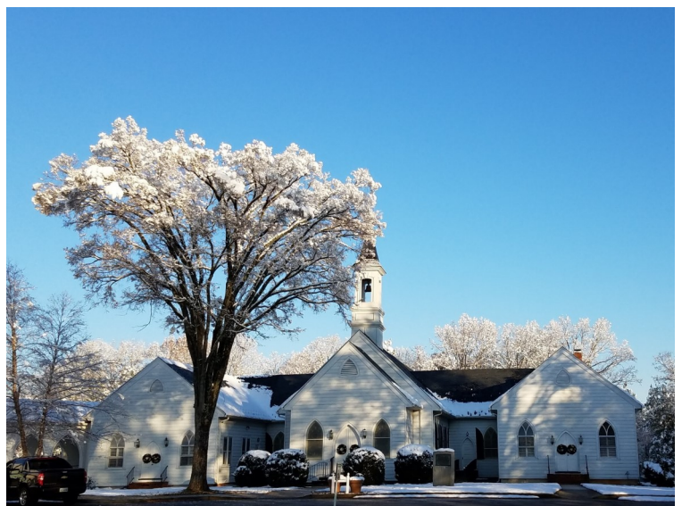
First snow of the year - December 10th